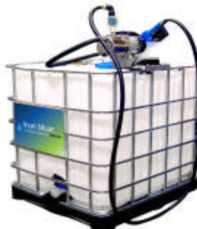
IBC not included