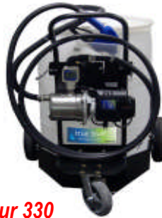
Drum not included