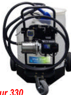
Drum not included