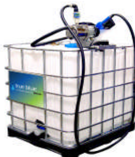
IBC not included